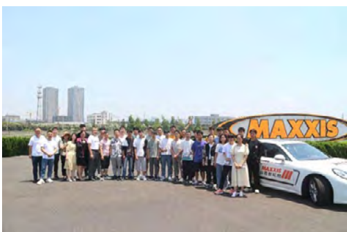
2021 Internship teambuilding activities