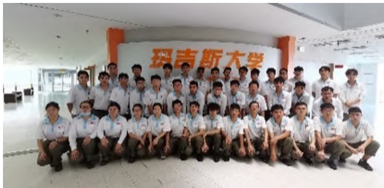
2022 Internship Teambuilding Activities