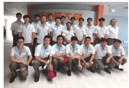
Team building activity for interns in Kunshan in 2023